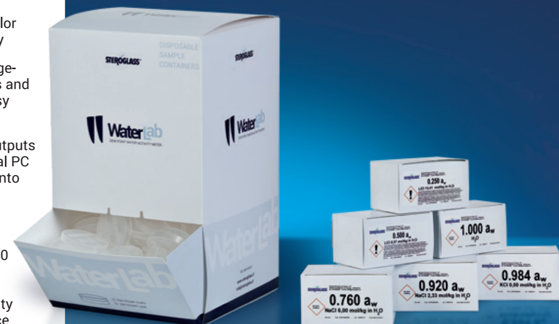
Cups and Lids available for any aW analyzer

Waterlab represents the state-of-the-art in water activity (aW) meters, and today it is an essential instrument for the quality control of products and ingredients in the food, pharmaceutical and cosmetic industries.